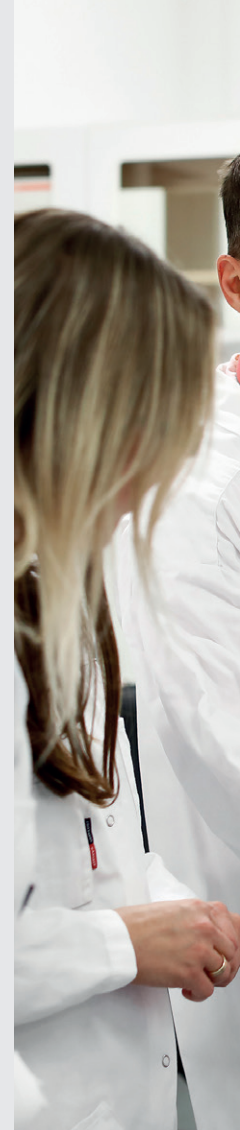
Total Insulin MBeads

Total Insulin MBeads Assay has been developed with a greater detection range allowing the measurement of higher concentrations of insulin, helping you avoid excruciating sample dilutions.