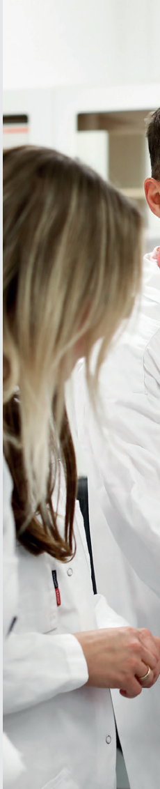
Total Insulin MBeads

Total Insulin MBeads Assay has been developed with a greater detection range allowing the measurement of higher concentrations of insulin, helping you avoid excruciating sample dilutions.