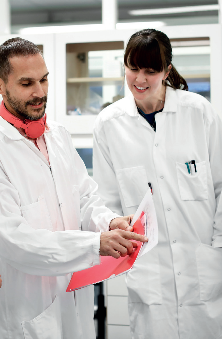
Assay is easy to use and makes more from less.